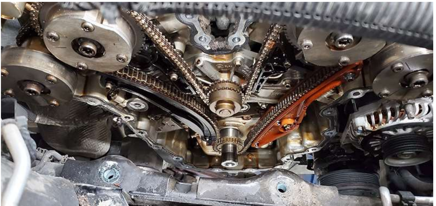
Signature Series kept the valvetrain area clean and deposit-free despite 350,000 miles (563,000 km) of severe-service city driving.

As the images show, the 3.5L six-cylinder engine contains virtually no deposits despite 350,000 miles (563,000 km) of severe-service city driving. The valvetrain area is clean and appears in excellent condition.